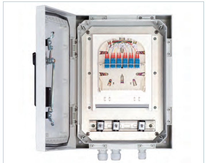
RDB equipped with 6 LC Duplex adaptors and 12 OS2 pigtails

If the box needs to be fixed to a signal mast, an additional adapter plate is available which can be mounted onto the distribution box.